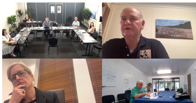
Senator Katy Gallagher, D. Irvine, Cr Kerr, Cr Scott, M.Eades (TCICA), Cr Hughes, Cr Pickering

Senator Katy Gallagher Shadow Minister for Finance Shadow Minister Public Service Senator for ACT