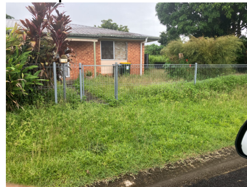
26 Seymour St, Innisfail Estate