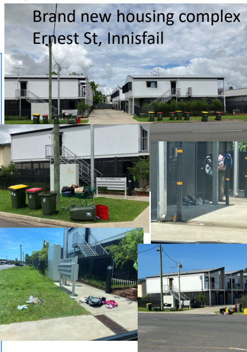
Brand new housing complex Ernest St, Innisfail