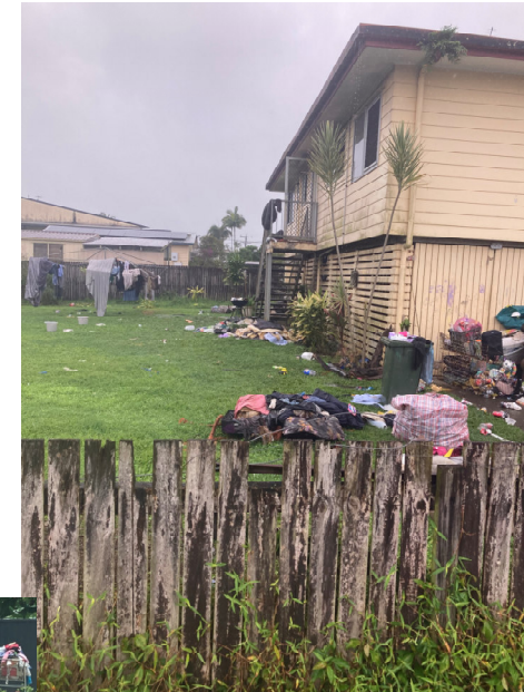
1 Sherwood Street, East Innisfail