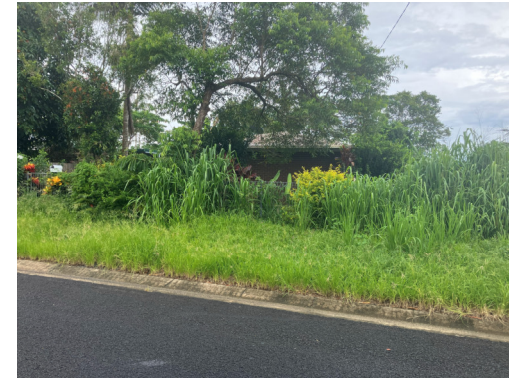
17 Seymour St, Innisfail Estate