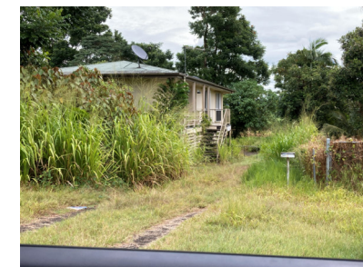
Badilla Street, Hudson