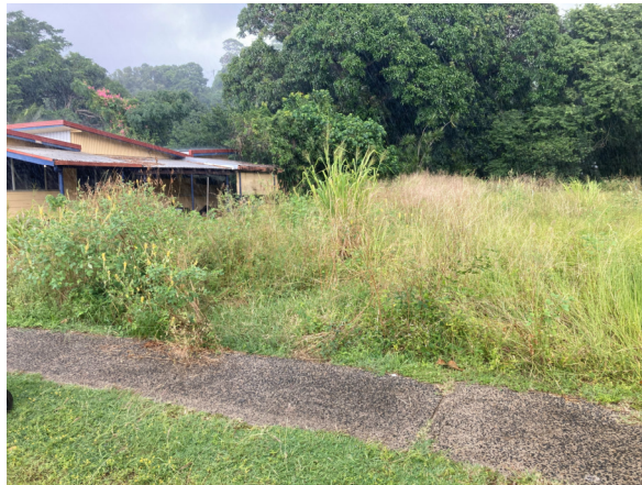
Elizabeth St, Flying Fish Point