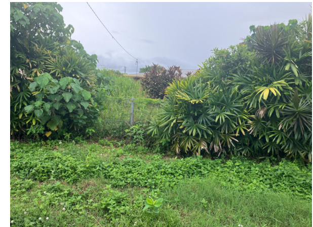
24 Seymour St, Innisfail Estate