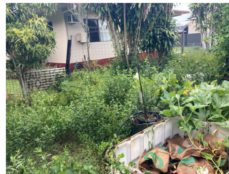
Jacobs Road, Kurrimine Beach