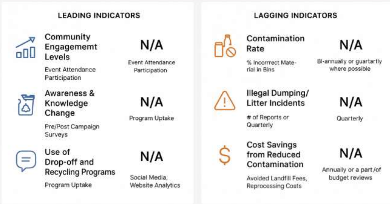
Figure 1 – Sample Dashboard to be developed as part of Regional Waste Education & Behaviour Change Program