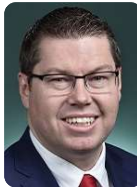
The Hon Patrick Conroy MP

Minister for Defense Industry, Minister for Pacific Island Affairs