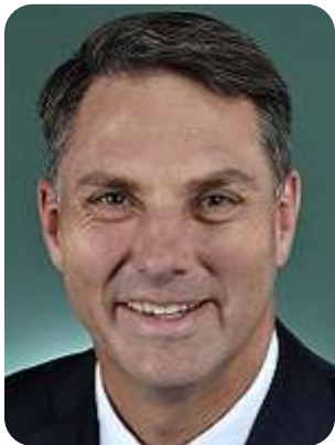
The Hon Richard Marles MP

Deputy Prime Minister and Minister for Defense