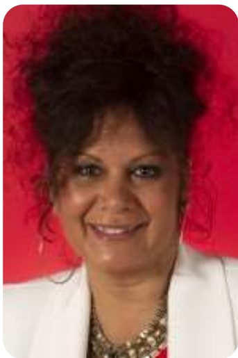
Senator the Hon Malarndirri McCarthy