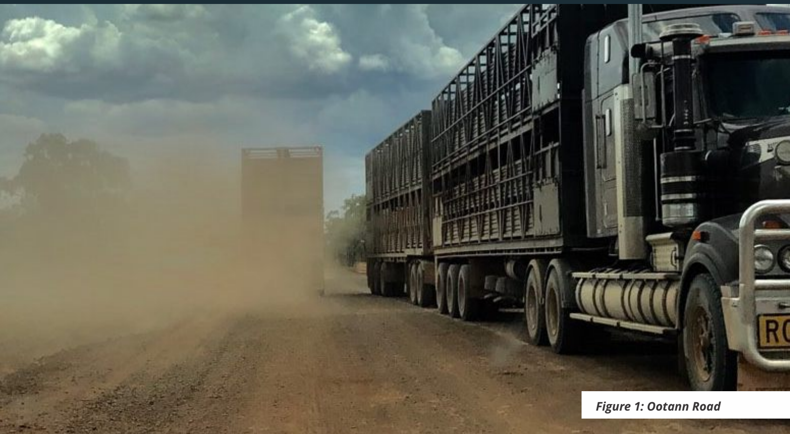
Figure 1: Ootann Road