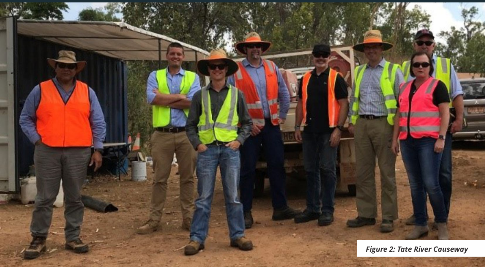
Figure 2: Tate River Causeway