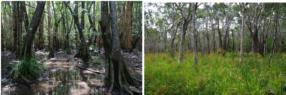
A landscape transformed - a Melaleuca wetland recovers after the mechanical control of a mature pond apple infestation at Baileys Creek in the Daintree. Manual control of seedlings will secure this site.

Stakeholders from across the region have actively collaborated on the management task at hand guided by adaptive management principles. Field techniques and approaches have evolved with the support of science, strategic planning and regional partnerships.